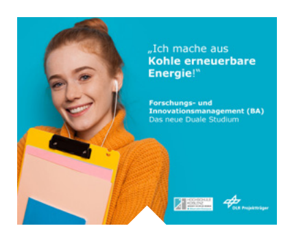
Concise, but successful: the advertising campaign for the dual study programme.

Our goal is to jointly develop our culture of exchange and cooperation. A motivating and encouraging start will help our students to develop their full potential, ultimately to the benefit of all employees.