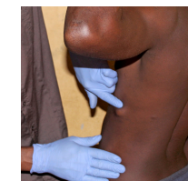
Onchocerciasis – nodule palpation | A TAKEOFF team member palpating the onchocerca nodules of a patient in Ghana. The subcutaneous nodules in which the adult worms reside are often in close proximity to the bones and displaceable.

In the second funding phase, TAKEOFF will maintain the momentum to help achieve the UN Sustainable Development Goals according to the WHO Road Map 2030 for NTDs. TAKEOFF will: follow up on its valuable filarial LE and podoconiosis cohorts to investigate how sustainable WHO hygiene protocols will become if patients are less intensely supervised than in a clinical trial; expand morbidity management centres and teams for eventual integration into national control programmes/health systems; elucidate links between two non-communicable diseases (diabetes and hypertension) and LE progression and wounds, incl. characterisation of antimicrobial resistance; help MOHs integrate digital health tools and data acquisition into their national and international health systems; and render assessments and recommendations of alternative treatment regimens to eliminate LF and onchocerciasis, including new regimens and WHO-recommended, environmentally safe larvicides for the latter condition.