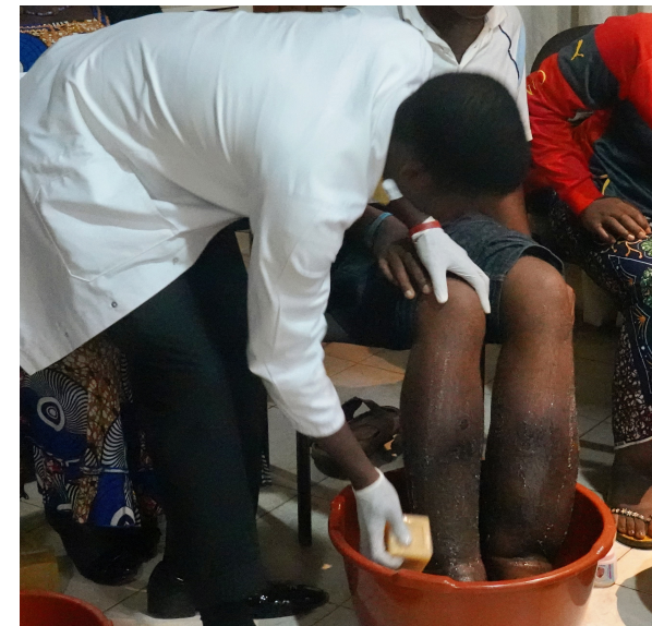
Washing of lymphedema | The TAKEOFF team in Cameroon showing the correct way to wash the affected legs.

TAKeOFF builds on the successes achieved by the network during its first funding period, which brought together researchers from Ghana, Tanzania, Cameroon and Germany to address obstacles to eliminating lymphatic filariasis (LF) and podoconiosis. The work completed 1) showed that digital health using mobile phones instead of paper lists increased lymphedema (LE) case identification and subsequent treatment; 2) established a GCP-compliant clinical trial platform (F-CuRE); 3) quantifiably confirmed for the first time that the application of stringent hygiene protocols alone effectively lessened morbidity, providing crucial input in the process of WHO morbidity guideline development; and 4) acquired the support of partner countries' ministries of health (MOHs) in sustaining morbidity management centres and teams for neglected tropical diseases (NTDs).