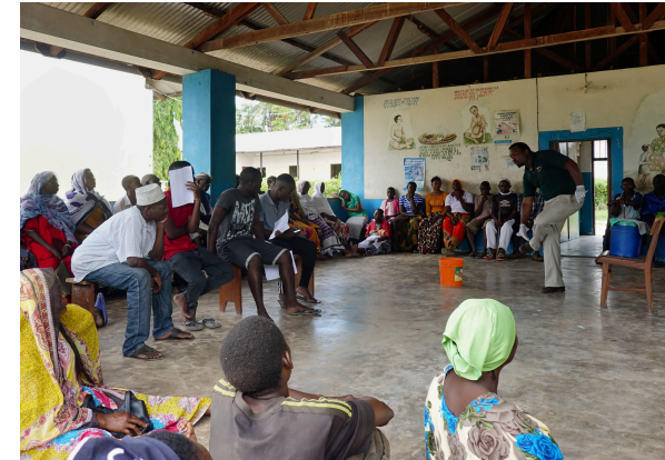
Hygiene training | The TAKEOFF team explaining the importance of hygiene management to community members in Tanzania.