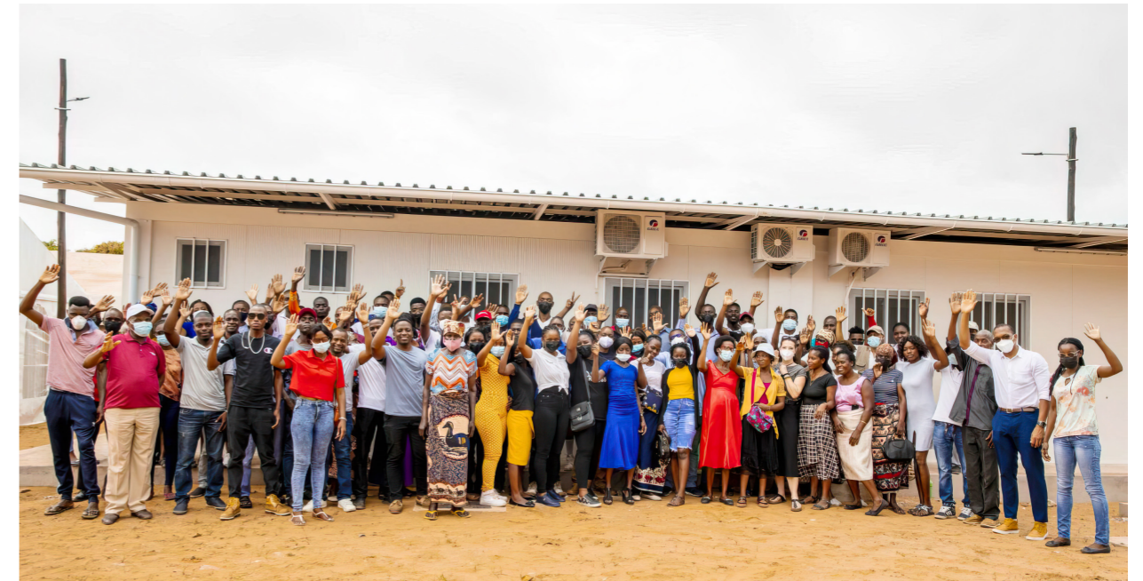
Instituto Nacional de Saúde (INS) – Maputo

Ludwig-Maximilians-University of Munich (Bayern) Research Center Borstel (Schleswig-Holstein)