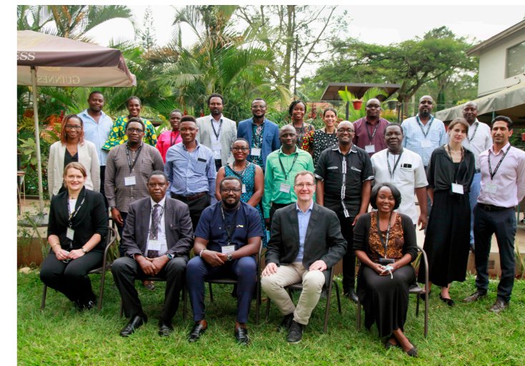
STAIRS Investigators (@Walimu)

of African research institutions well-positioned to manage and conduct robust studies, including clinical trials. With additional partners like the African Institute for Development Policy and Africa Centres for Disease Control and Prevention, STAIRS will be poised to bridge the translation gaps among research, patient safety, and policy and engage key stakeholders in the ongoing transfer of scientific output into action in accordance with the 2017 WHO Sepsis Resolution.