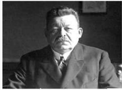
Founded in 1925 as the political legacy of Friedrich Ebert