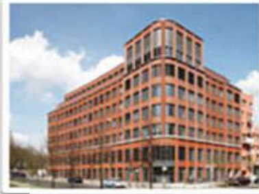
A government-financed, non-profit, independent, private and publicly registered association