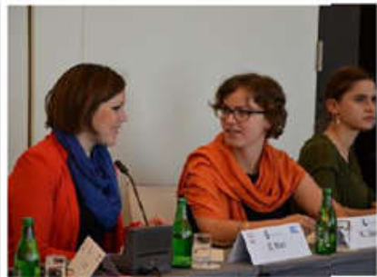
Political education; policy think tank; scholarships; international cooperation; archive