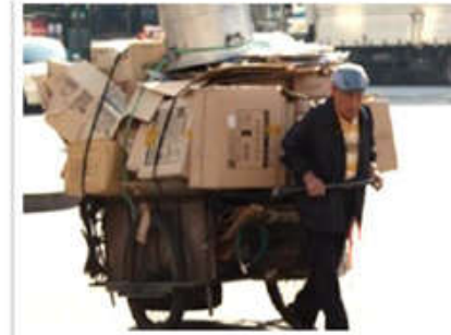
Social democracy: Justice, solidarity and freedom